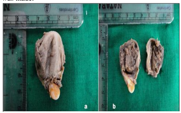
Fig- 1: a. The gross specimen was measuring about 4x3 cm in size, b. The cut surface revealed a cystic lumen with a soft tissue growth filling most of the cystic space.

a diagnosis of Adenomatoid odontogenic tumor (AOT) was made.